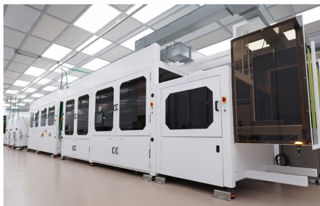
Cell assembly equipment on the Eagle Line