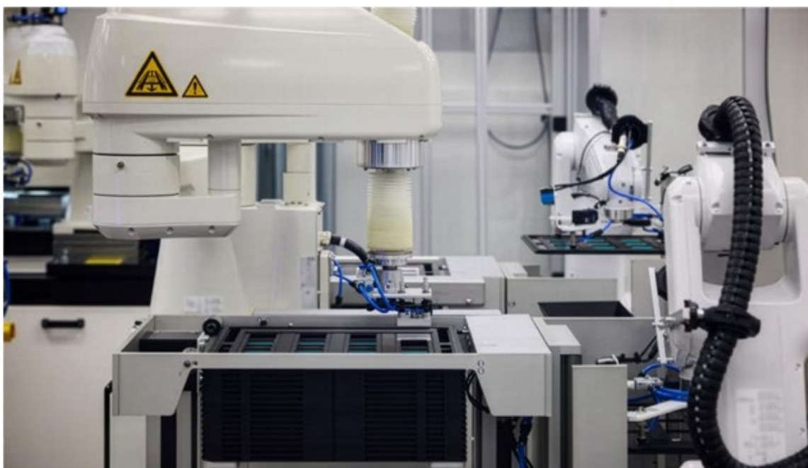
Automated production equipment on the Eagle Line

In addition to demonstrating scalable production, Eagle Line will help enable customer shipments of QSE-5 cells. In Q2 we plan to ramp QSE-5 cell production to support customer programs across automotive and other applications.